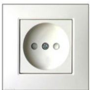
TYPE C EUROPEAN CEE 7/16 EUROPLUG WALL OUTLET

IN HUNGARY THE POWER PLUGS AND SOCKETS ARE OF TYPE C AND F. THE STANDARD VOLTAGE IS 230 V AND THE STANDARD FREQUENCY IS 50 HZ.