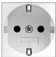
TYPE F GERMAN STYLE CEE 7/4 SCHUKO WALL OUTLET