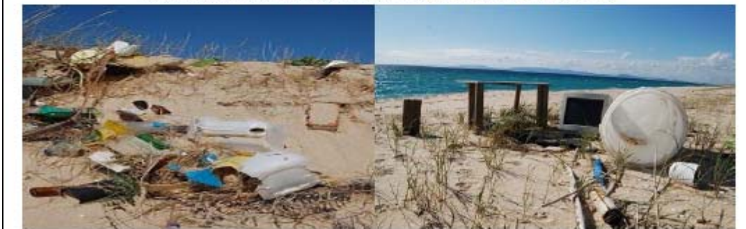
Imagens da zona costeira entre Tróia e Melides