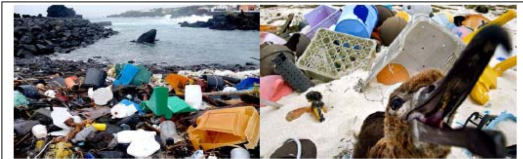
Imagens da zona costeira das ilhas dos Açores