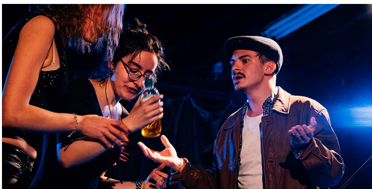
Bottom right: Exhibition opening evening