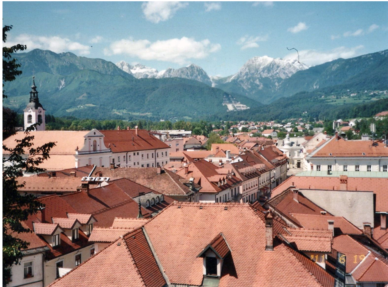
Photo below: View over northern part of Kamnik from Mali grad Hill.

Learn more about Kamnik by visiting: https://www.slovenia.info/en/places-to-go/regions/ljubljana-central-slovenia/kamnik .