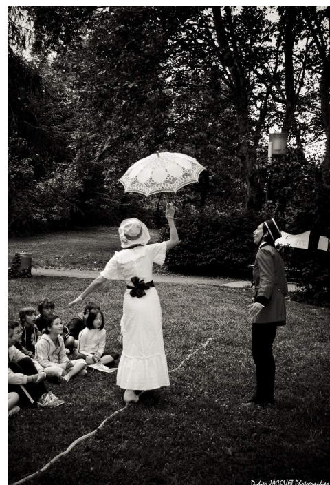
Contes sur le fil