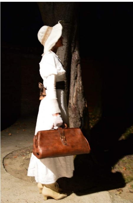
Contes en Voyage