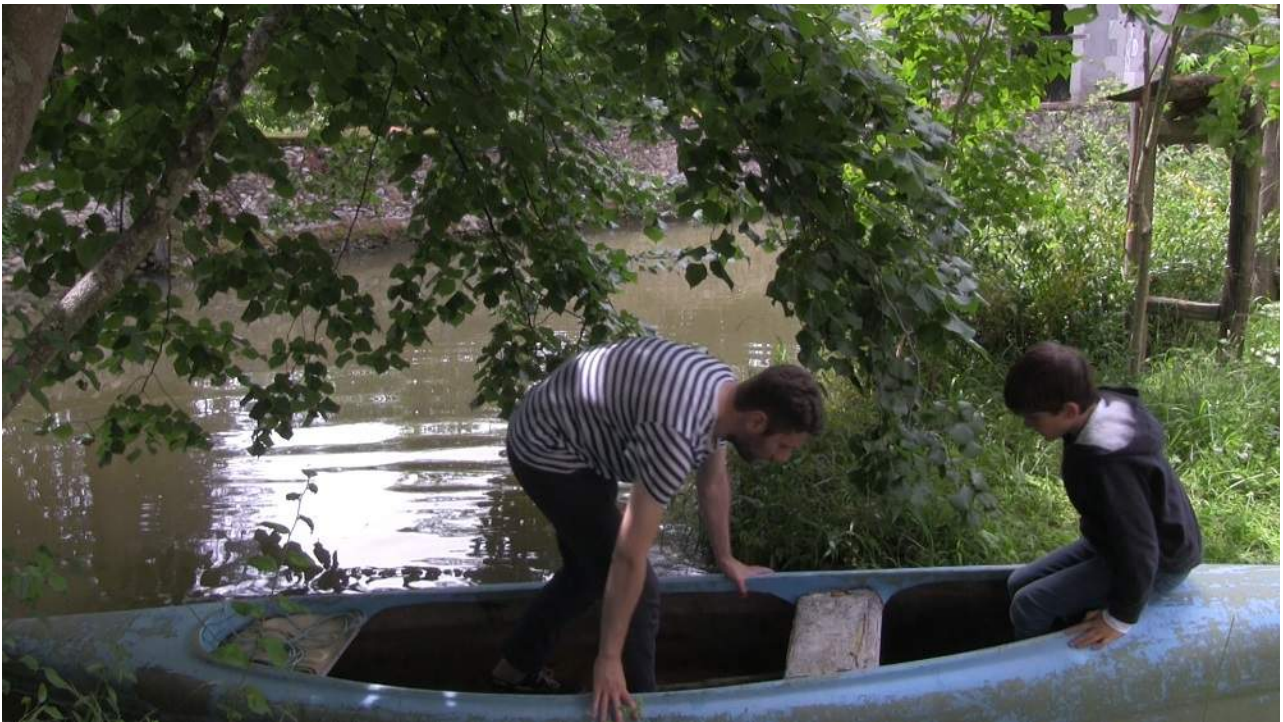
Le voyage de Théophile

Currently, we are working on a documentary about ecology.