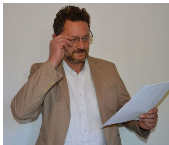
Ne tirez pas sur l'oiseau moqueur