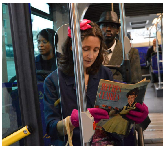
Sur les traces de Martin Luther King