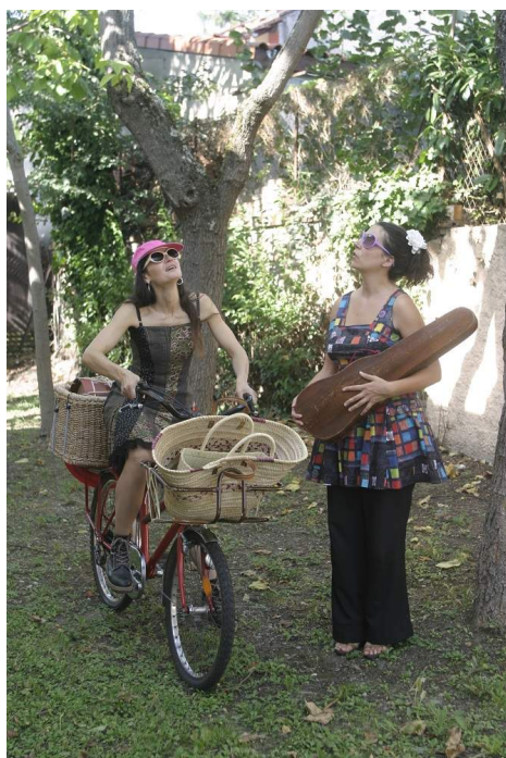
Contes à vélo

An ever-present aspect of our work is our commitment to protecting the environment (e.g. using second-hand materials, non-waste measures, low-emission transport, etc.). In 2011, this is how we were inspired to create Contes à Vélo ( Bike tales ). We then created Contes sur le Fil ( Tales on a tightrope ) which we performed at the 2012 Fête du Vélo, in collaboration with the Maison du Vélo (Bike's house) of Toulouse.