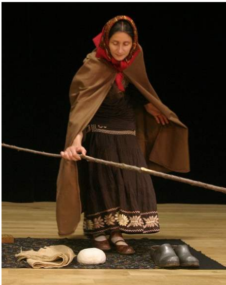
La plume de Finist Fier Faucon

Two more children's plays followed: La Petite Maison ( The little house ), based on a story by Gianni Rodari; and Contes En Voyage ( travelling tales ), a musical created in 2013 for the Toulousains et Toulousaines d'Ailleurs festival, an event celebrating travel and tolerance.