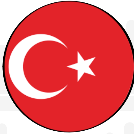
ANKARA STUDENT YOUTH GROUP