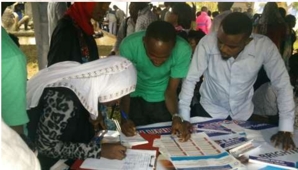
YUFT Metal Works Project Team at Uganda Museum during the 2017 Youth Skills Expo