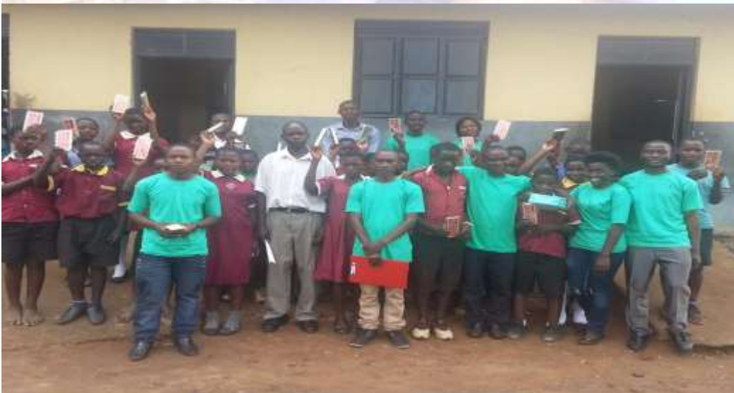
Photo; YUfT Metal Works Project pose for a Photo together with the Headteacher and the students after the awareness campaign at Bukondo Primary School in Wakiso.