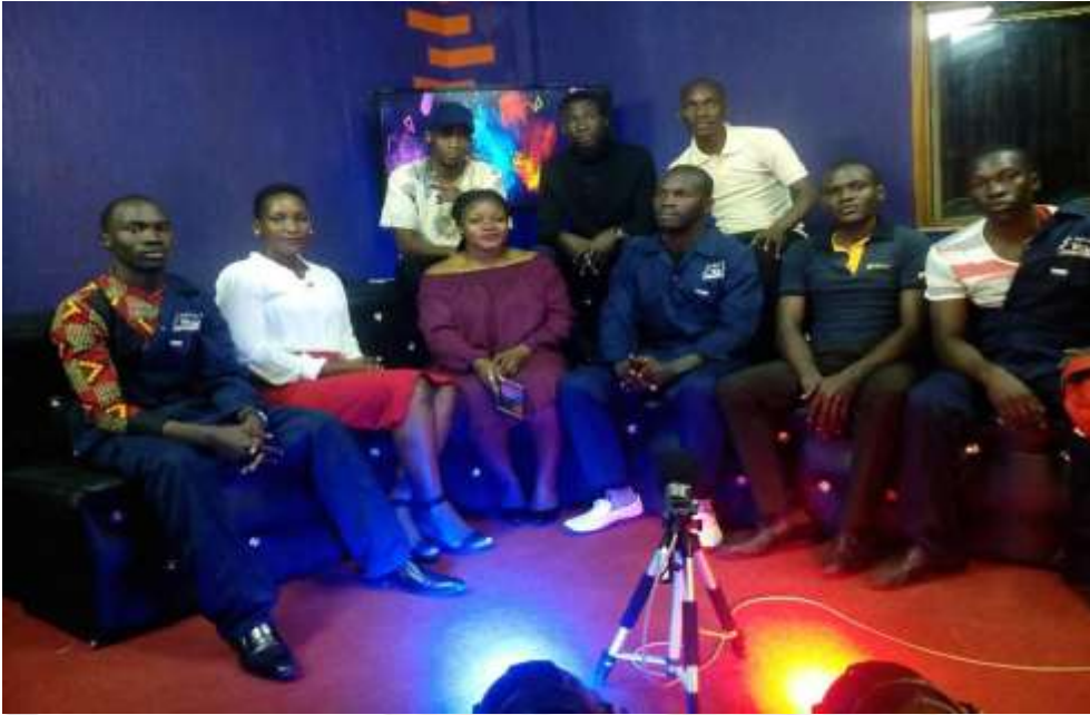
Our Team on KSTv