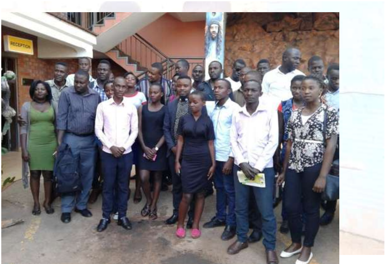
YUFT Metal Works Team Pose for a Photo with the Business Growth Trainers at Nob View Hotel; Training organized by JAWCU and OXFAM Uganda.