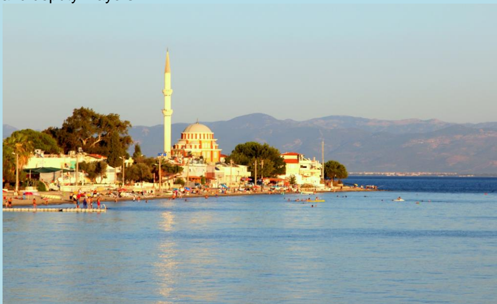
Autumn in Edremit

Communication between the volunteer and the organization will be provided by mentor. Mentor will come together one a week (or if needed more) for sharing with volunteers of concerns, problems, expectations, results, achievements and joys. The mentor will help you properly according to your needs. Furthermore Volunteers will receive support from the mayor and deputy mayors.