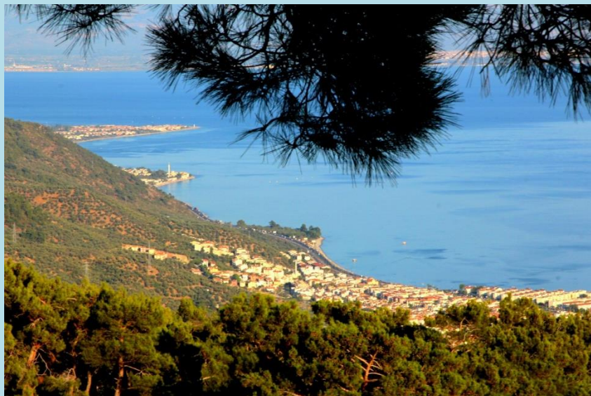
View of Altinoluk,Edremit