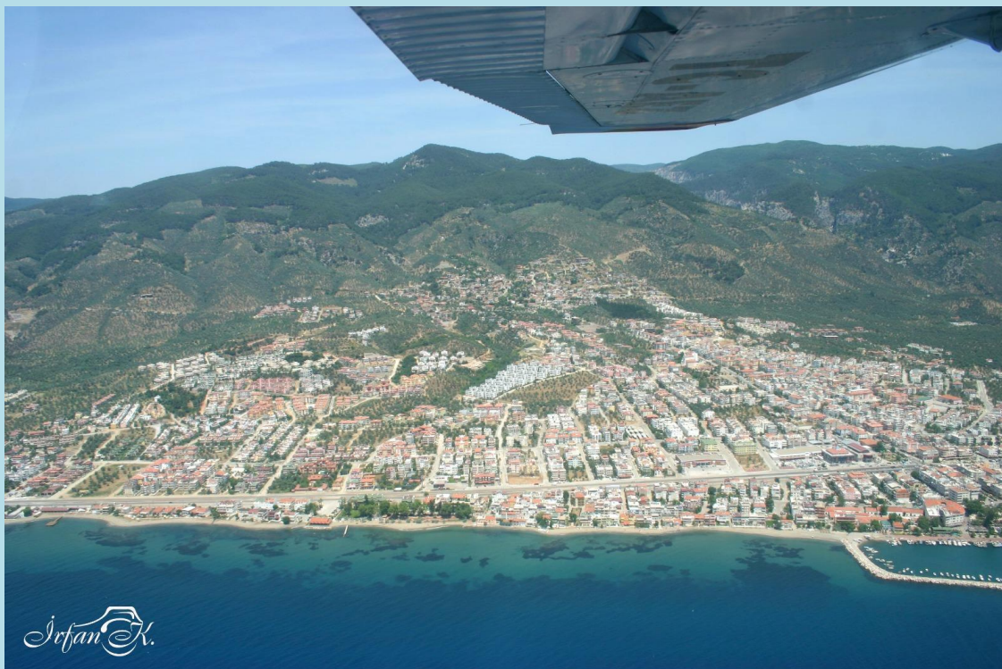
Ida Mountain and Altinoluk, Edremit