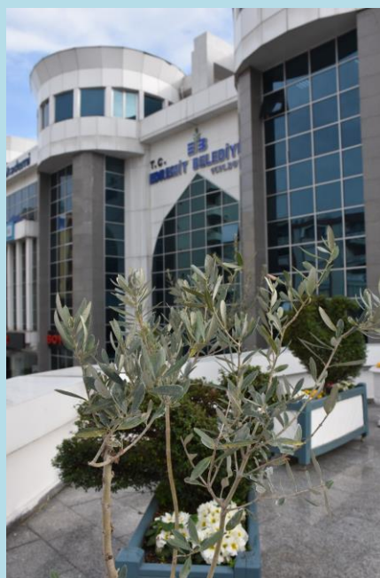
City Hall of Edremit