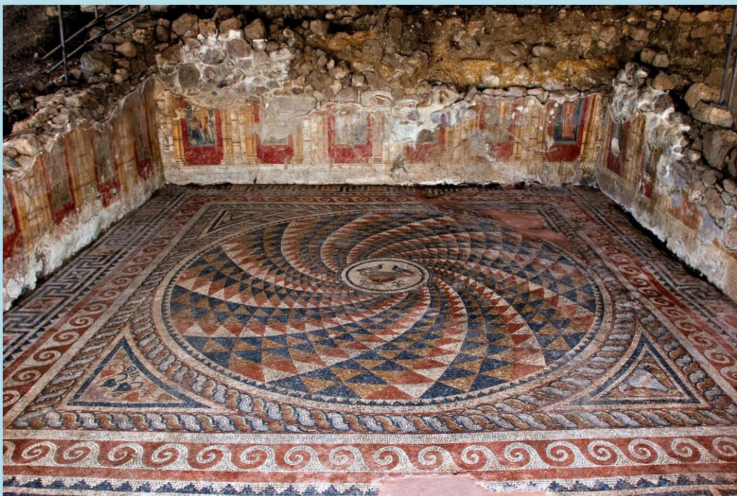
Antandros Ancient City