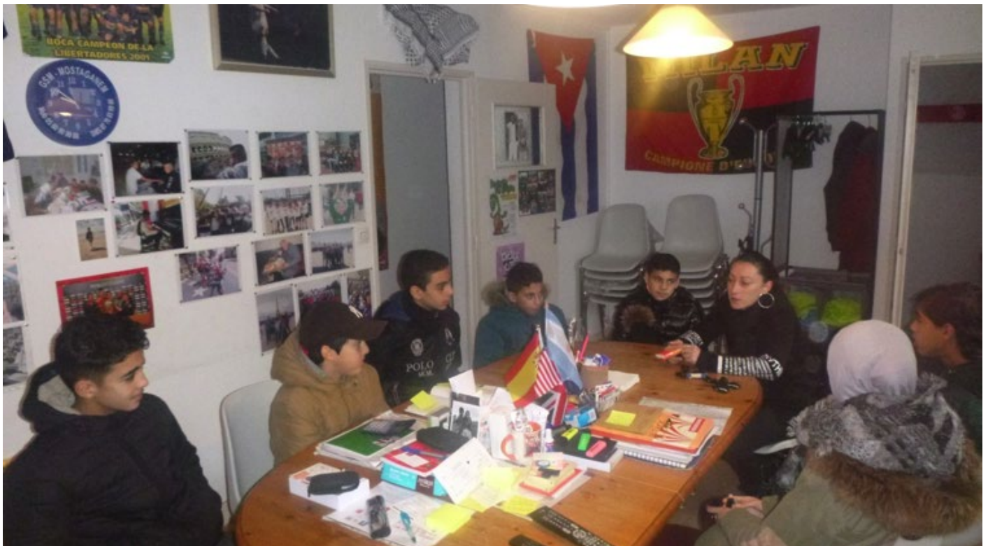
Presentation meeting-workshop writing to young people

Create a local dynamic of young people project's leaders