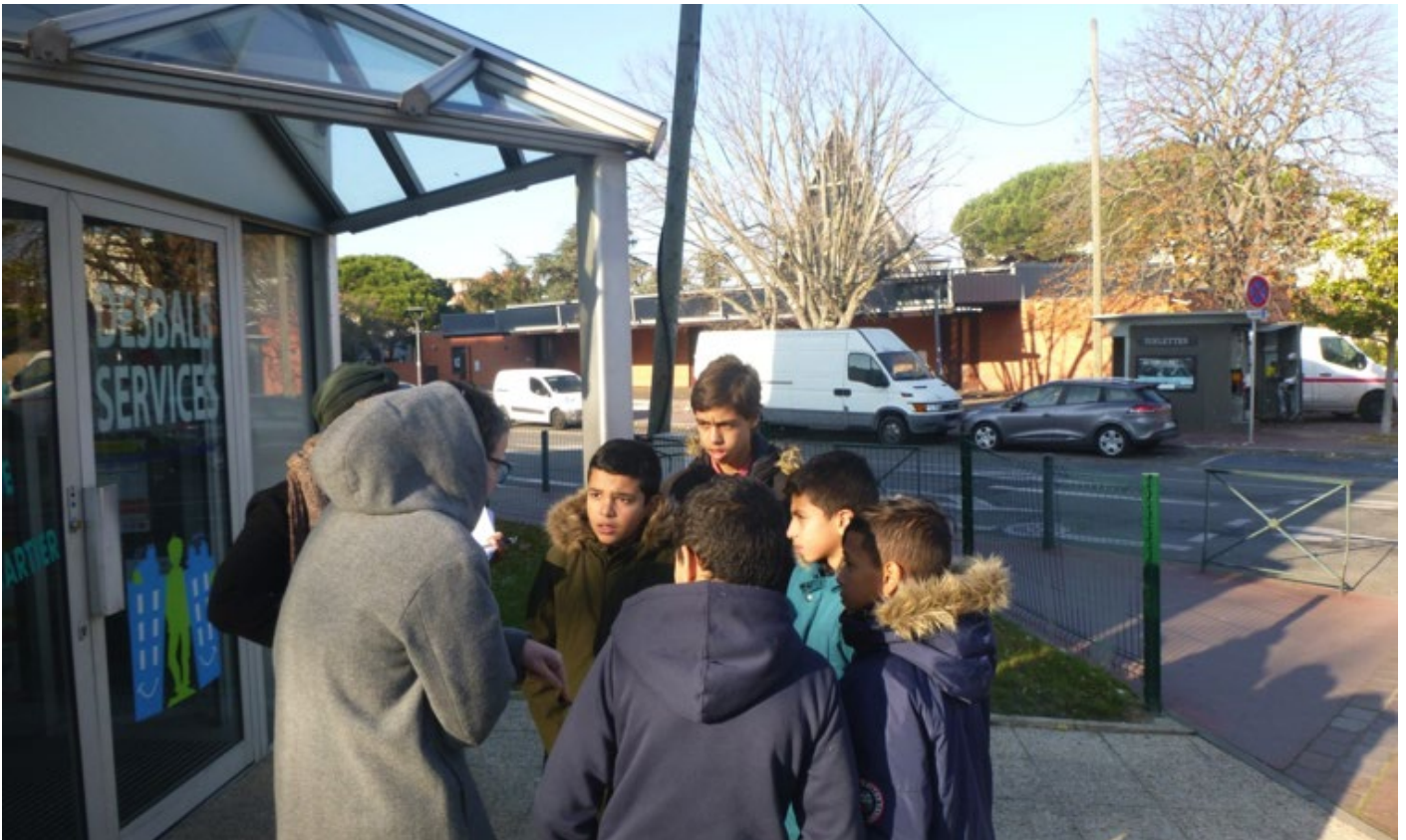
Neighborhood governance and young people speaking about global warming

The result of these general workshops, which will be spent during the all year long, reception and assessment including, will enable the various groups of young people hosted in Toulouse to conduct thematic workshop, creative and innovative initiatives in their living spaces life and understand the effects of global warming for young people, so that they can understand they have an impact and role, they are engaged actors, responsible and they can transmit those values of life.