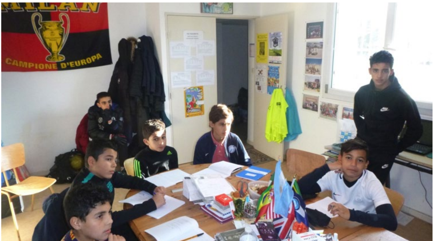
Young Toulouse in meeting-preparation of a project.