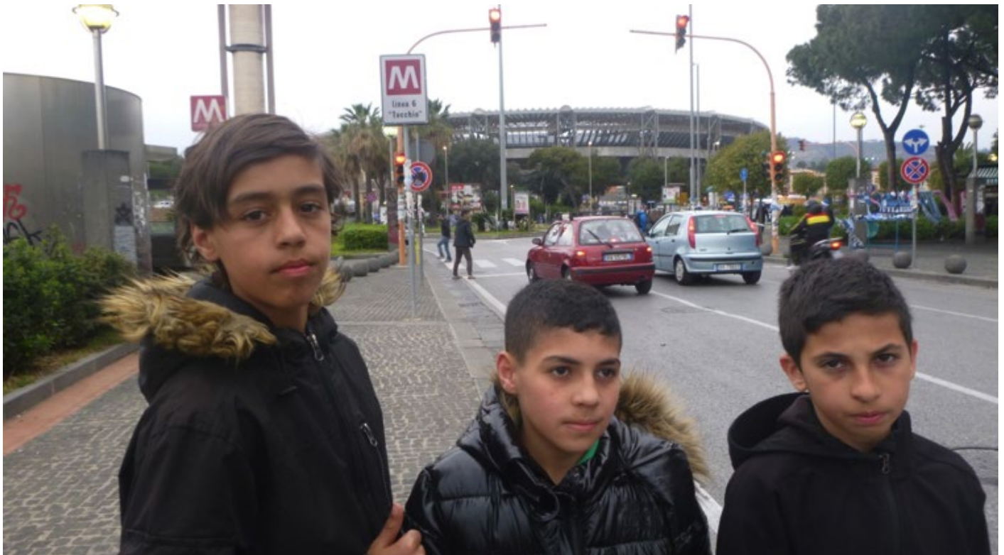
Young Toulouse people discovering Naples-Italy

12 young volunteers for the management of the invited groups.