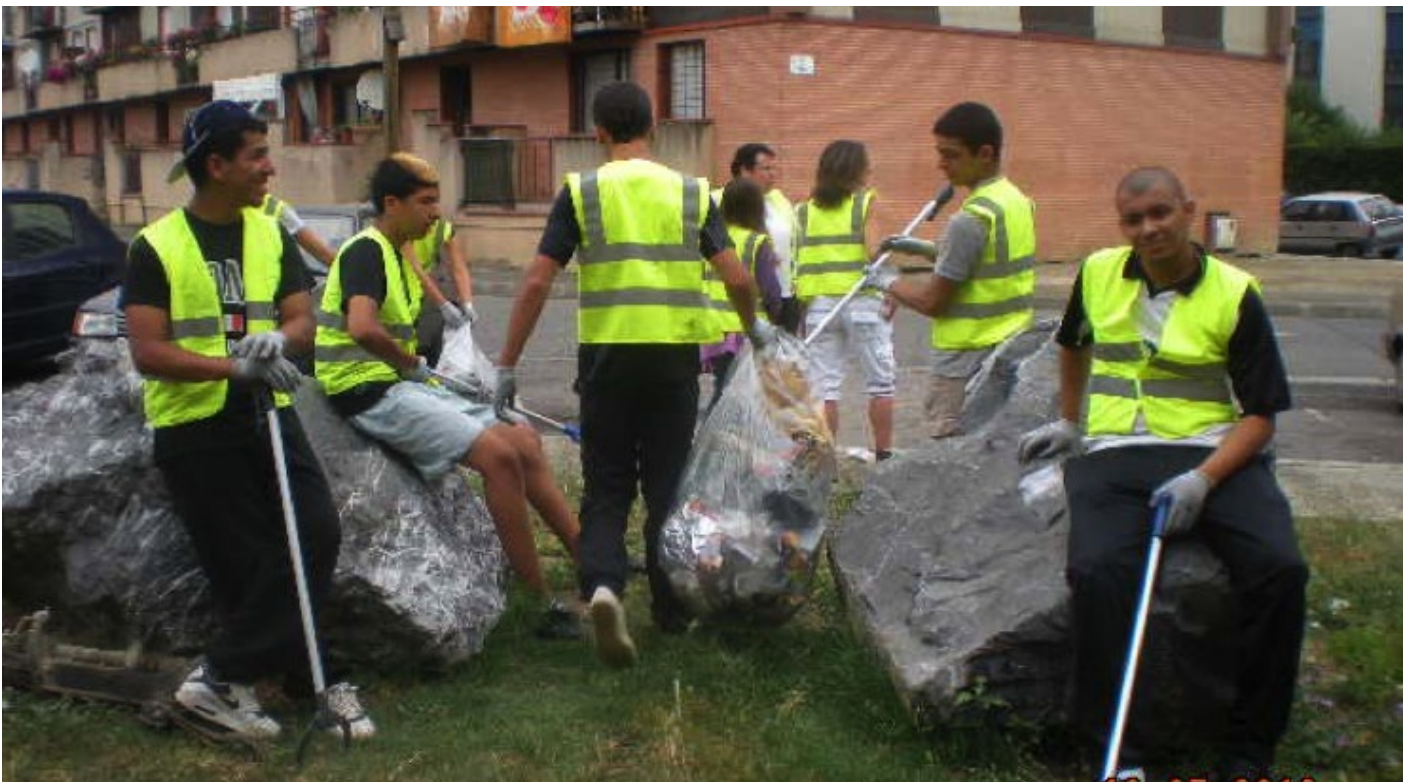
Eco citizenship project in neighborhoods every summer

Our role is to be present in the district, to create social link, to enroll young people to be involved in the community life in their city, in their country.