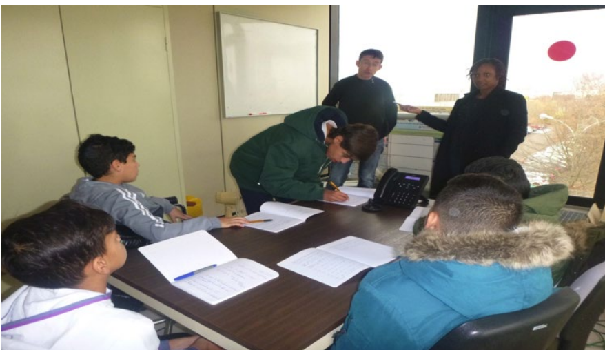
Meeting at Météo-France with climatologist and young people

19 supervisors included the guests of honor from Algeria.