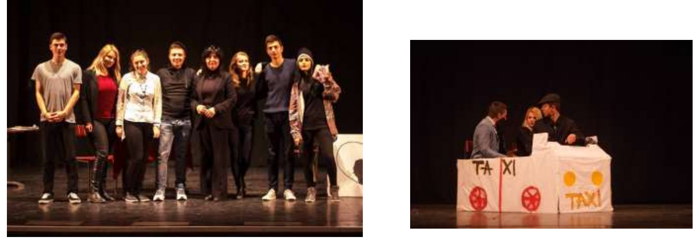
French Theater Contest in Prilep: Two EVS French volunteers took participation as actors