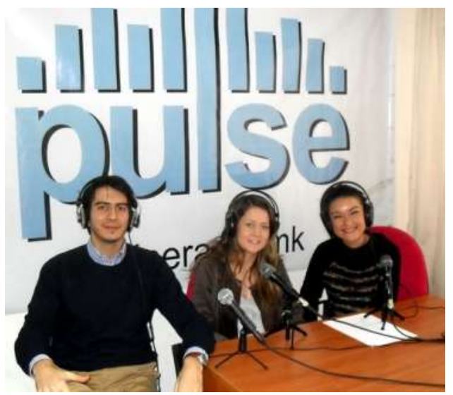
EVS volunteers working in the PULSE Radio

EVS volunteers working with children in schools in Prilep