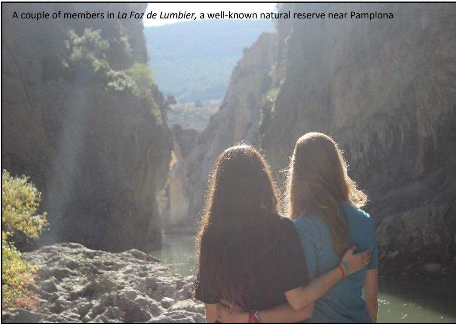
A couple of members in La Foz de Lumbier , a well-known natural reserve near Pamplona

We offer a project in our province, Navarre. We would prefer going abroad next summer (2017) and hosting the partner in Spain the following year (2018), although we are totally open to discuss the order of the exchanges.