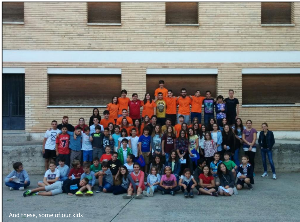
And these, some of our kids!

CTL Eguaras was born on October 4 th , 2003. We are a non-profit and NGO that deals with free time, non-formal education; nature, we foster moral, ecological and intercultural values, through several activities that we design along every year in many places in Spain (especially Navarre and Basque Country). Our main aim is to make younger generations aware of the multiculturalism and the respect needed to live in increasingly globalized world.