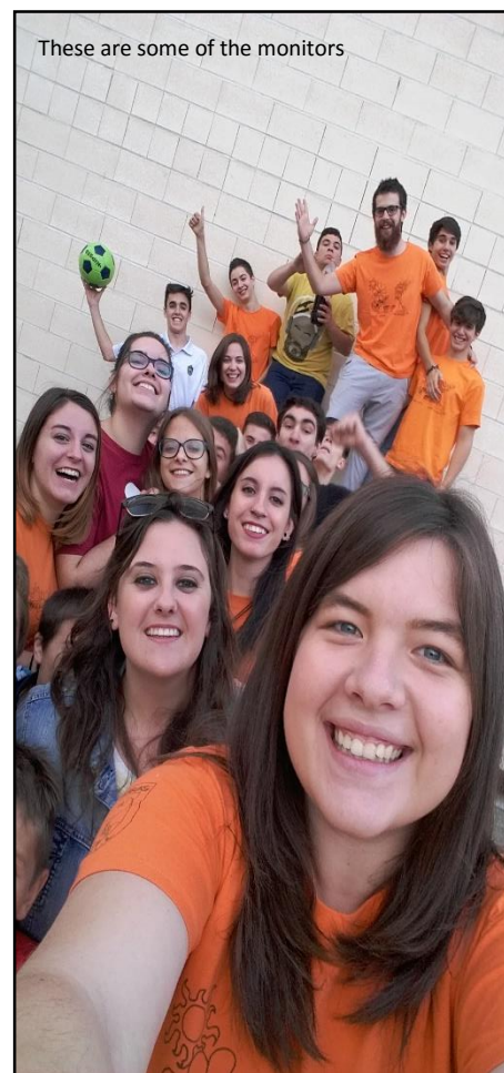
These are some of the monitors