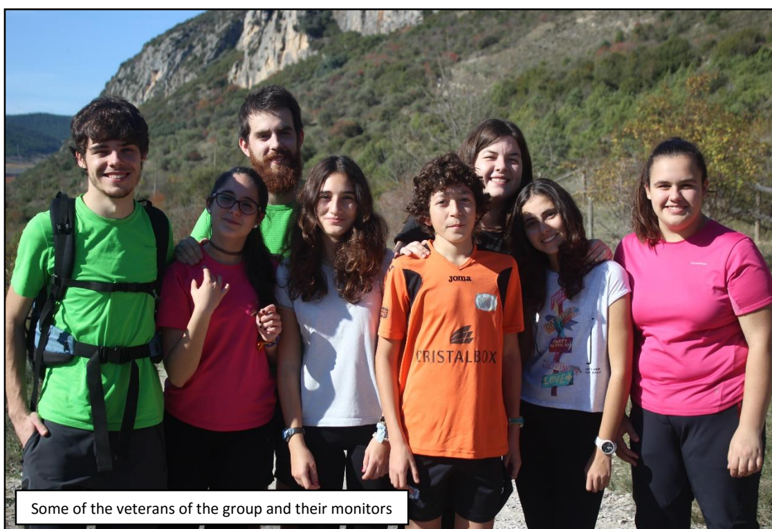
Some of the veterans of the group and their monitors

We organize three camps every year (Christmas, Easter and summer), many excursions, St. James Way, and sport activities in different natural environments, forests, mountains of our province and nearby. By doing these activities, we try to instil our kids in several and important values for current world, especially respect, collaboration, altruism and mutual understanding.