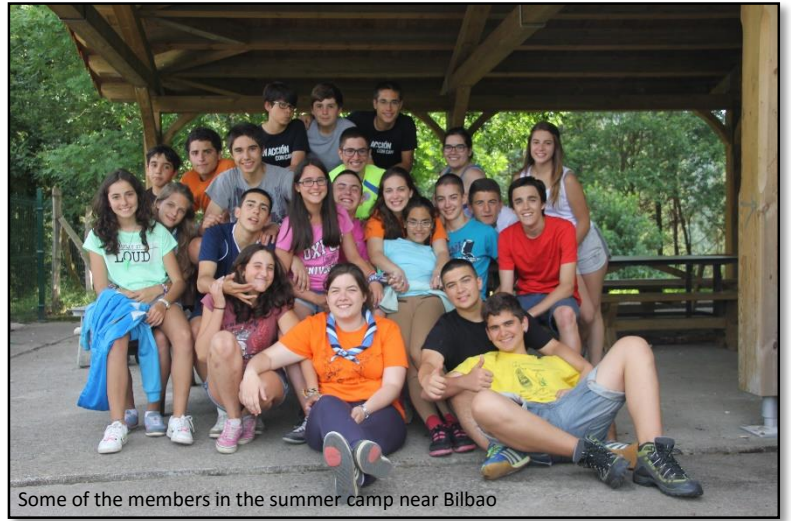
Some of the members in the summer camp near Bilbao

We are looking for a partner to participate with us in a project embedded in the Erasmus+ KA1 programme (youth exchanges) for the next summer (2017) and then doing the reverse exchange in the following summer (2018). Our idea is to collaborate in the creation of a project for our elder participants (15-17 years old) based on sports, nature, culture, customs, identity, international dialogue and European sentiment of citizenship. We would like to participate in a project that links culture and identity (dancing, gastronomy, music, myths...), fostered by doing sport, nature activities, non-formal education and knowing more cultures than ours! The main goal would be to demonstrate that even being so different one from the other, we can work together for a better world, in which every culture is respected and accepted by everybody, especially by younger generations in Europe.