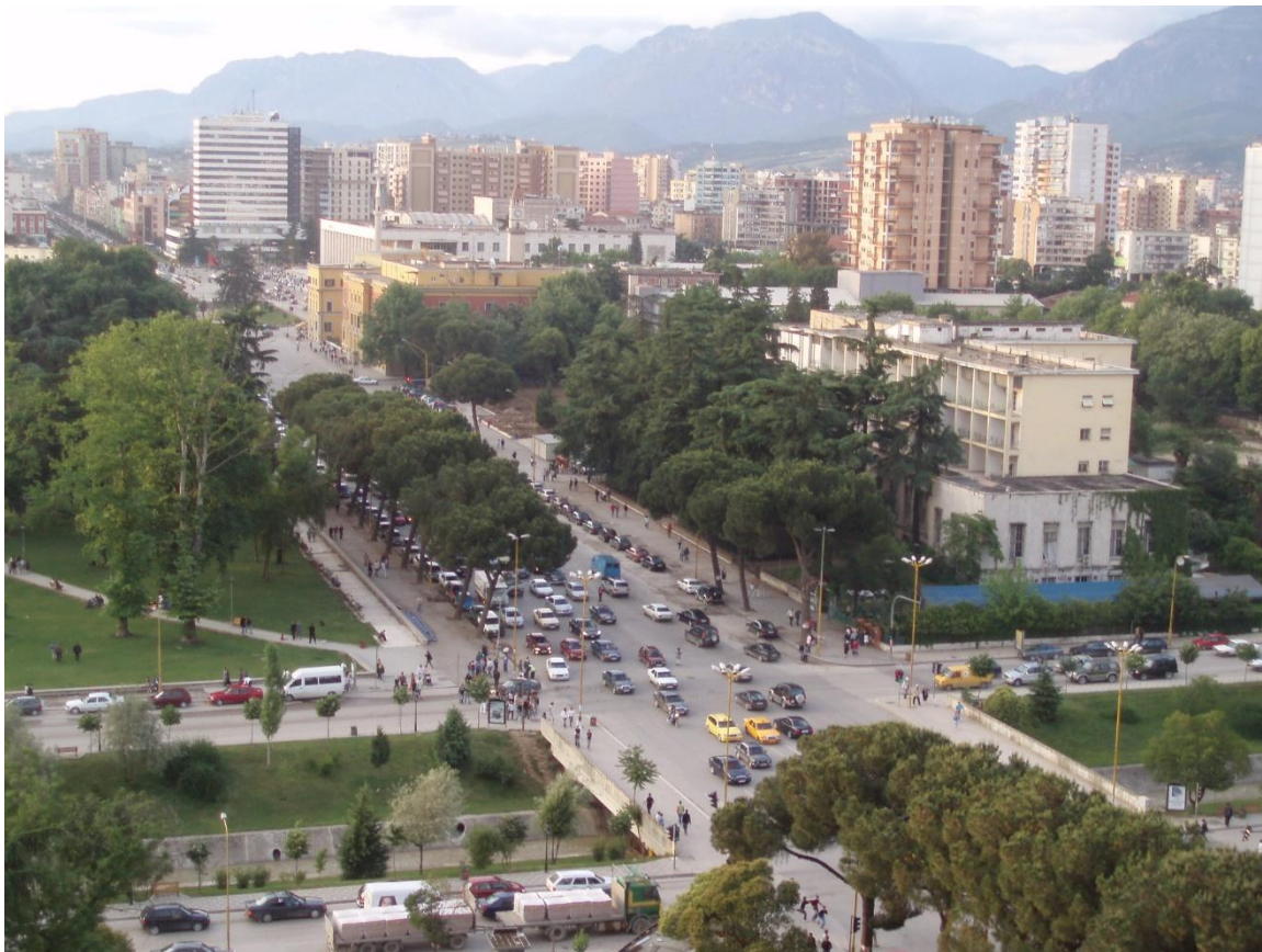
Main boulevard North-South in Tirana