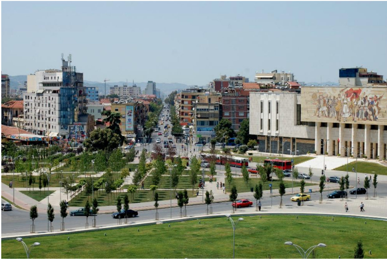
Main square in Tirana, around 400 m far from the office