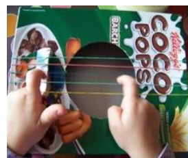
Handmade Musical Instruments