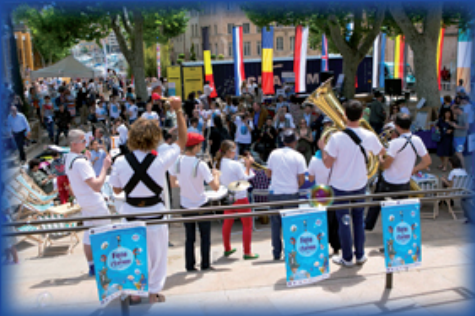
Europe day 2013 at Marseille, Place Bargemon

Europe Day is an annual celebration of peace and unity in Europe. It is also a festive and convivial event which allows sharing traditions, values and cultures to better know and understand each other. It is a real opportunity to exchange, inform and promote European programmes.