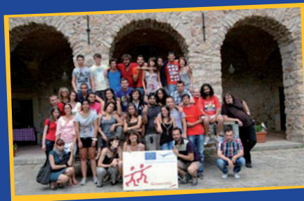
Youth exchange, European Humour in Italy

Youth Exchanges offer an opportunity for groups of young people from different countries to meet and learn about each other's cultures. The groups plan together their Youth Exchange around a theme of mutual interest.