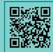
Ambassador QR Code

Explore ESG/Sustainability Information Faster 1 Sustainable Ltd - UK https://1planetonly.com/