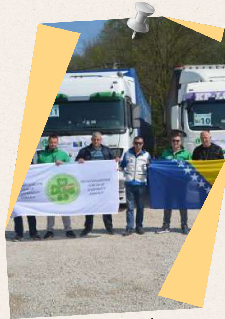
Humanitarian Aid for Gaza