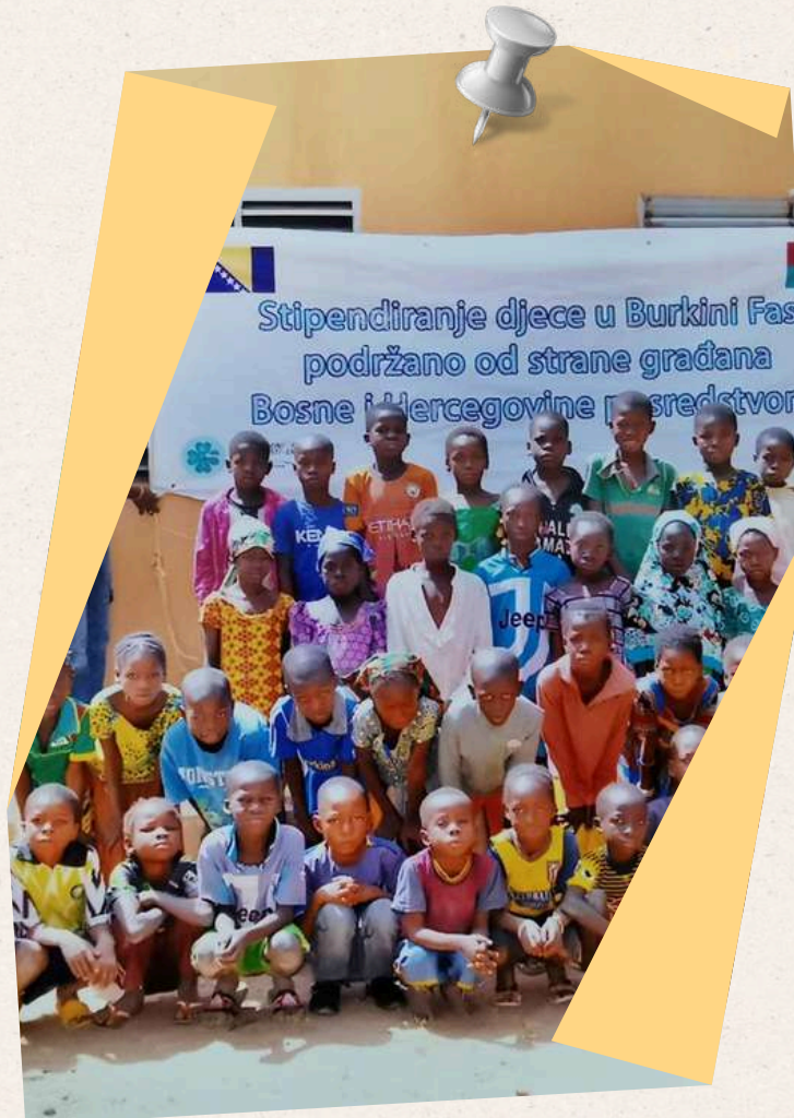
Burkina Faso Support