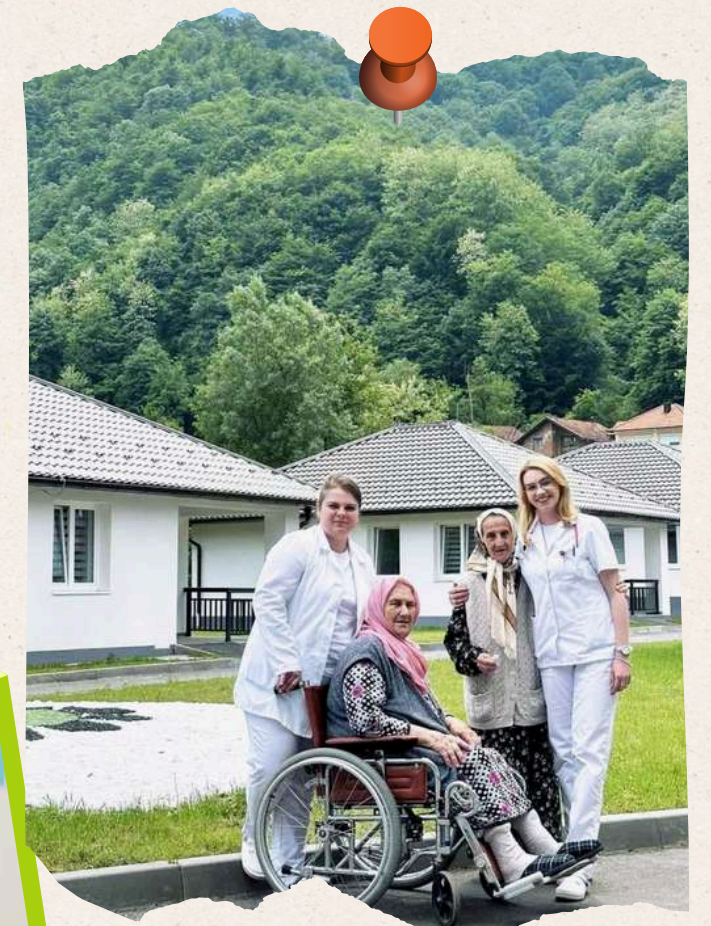
Community Services for the Elderly