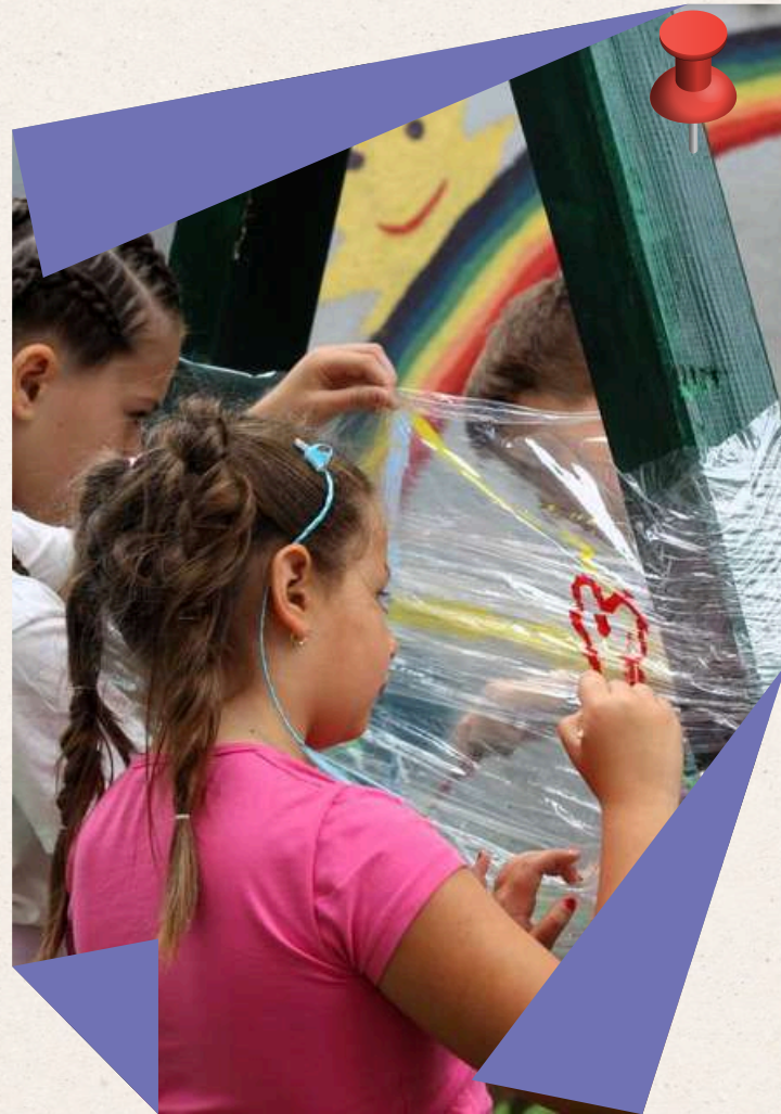
Children Daily Center