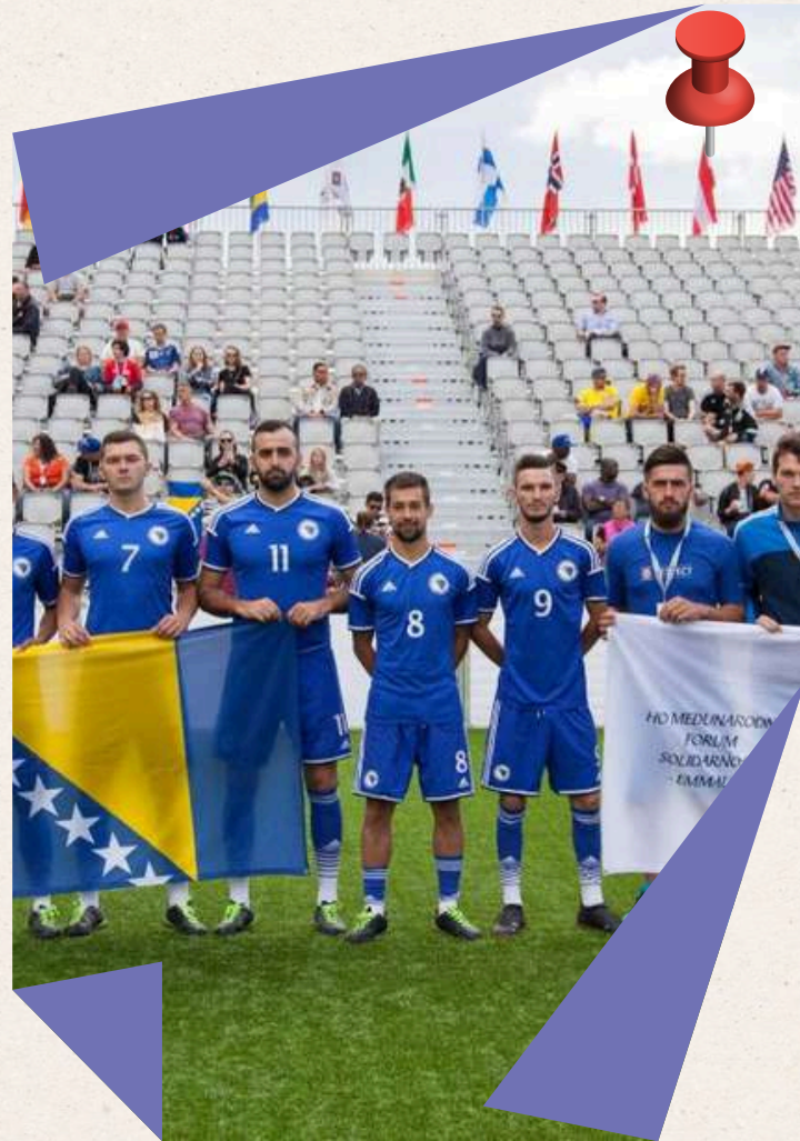
Bosnia and Herzegovina Homeless Representation