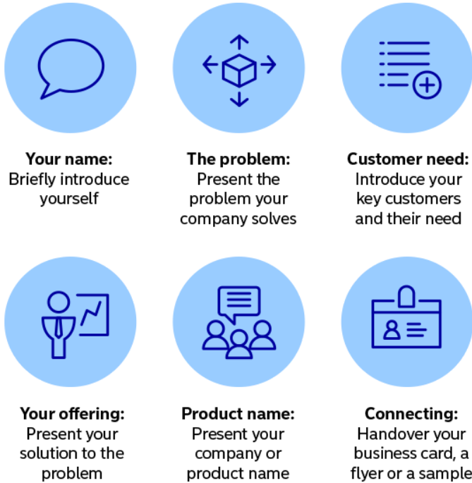
Fig. 02 Perfect your Business Pitch (Nordea, 2022)

The Pitch can follow the scheme presented above (Nordea, 2022), starting with: