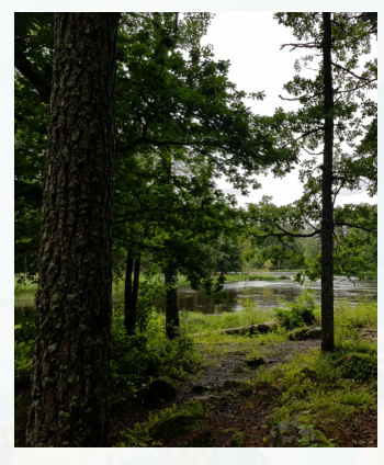
Färnebofjärden National Park, nearby our course venue