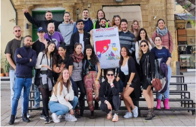
Non Formal Lab Training Course, 22-30 June 2022