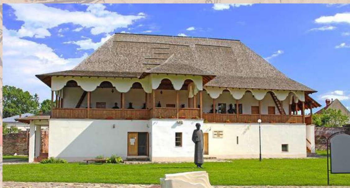
Printing & Old Book Museum