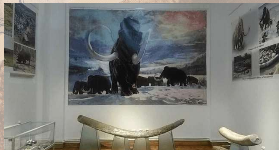
Museum of Evolution in the Paleolithic