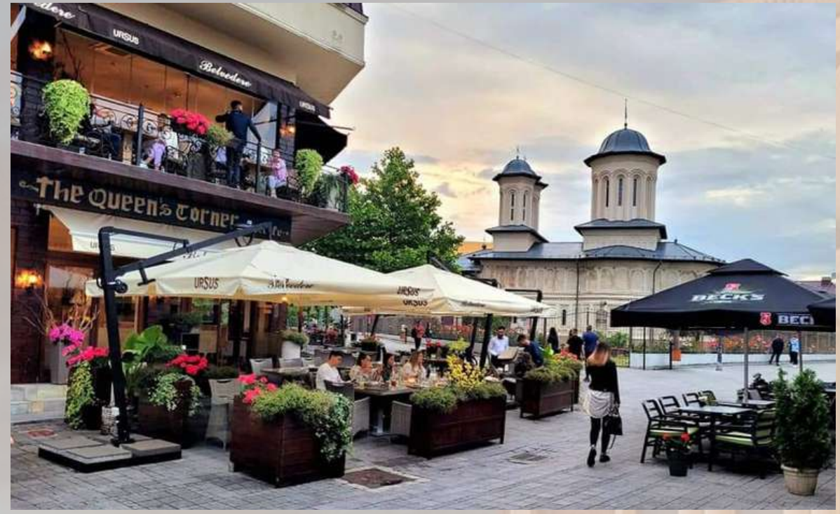
Belvedere pub-Old Center