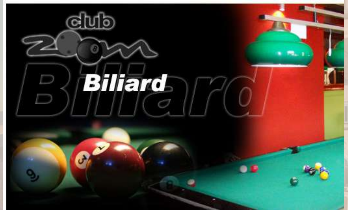
Zoom-Biliard & Bowling