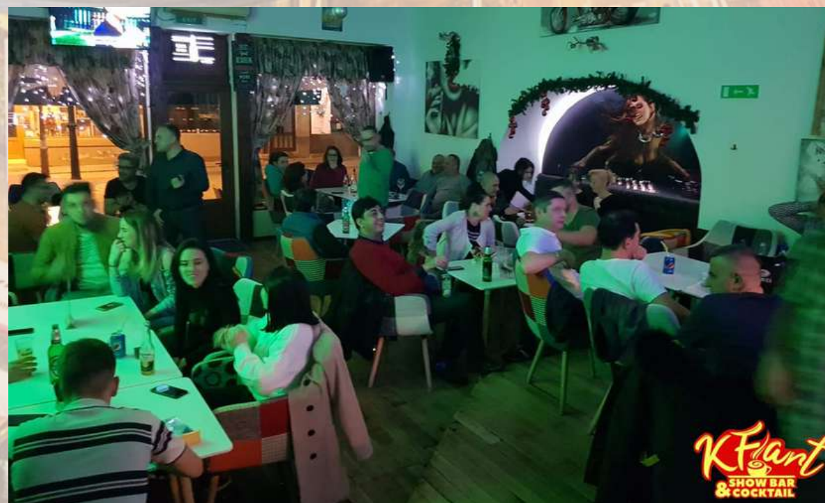
KF Art offers karaoke evenings