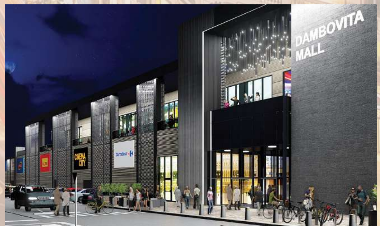
Dambovita Mall Shopping center