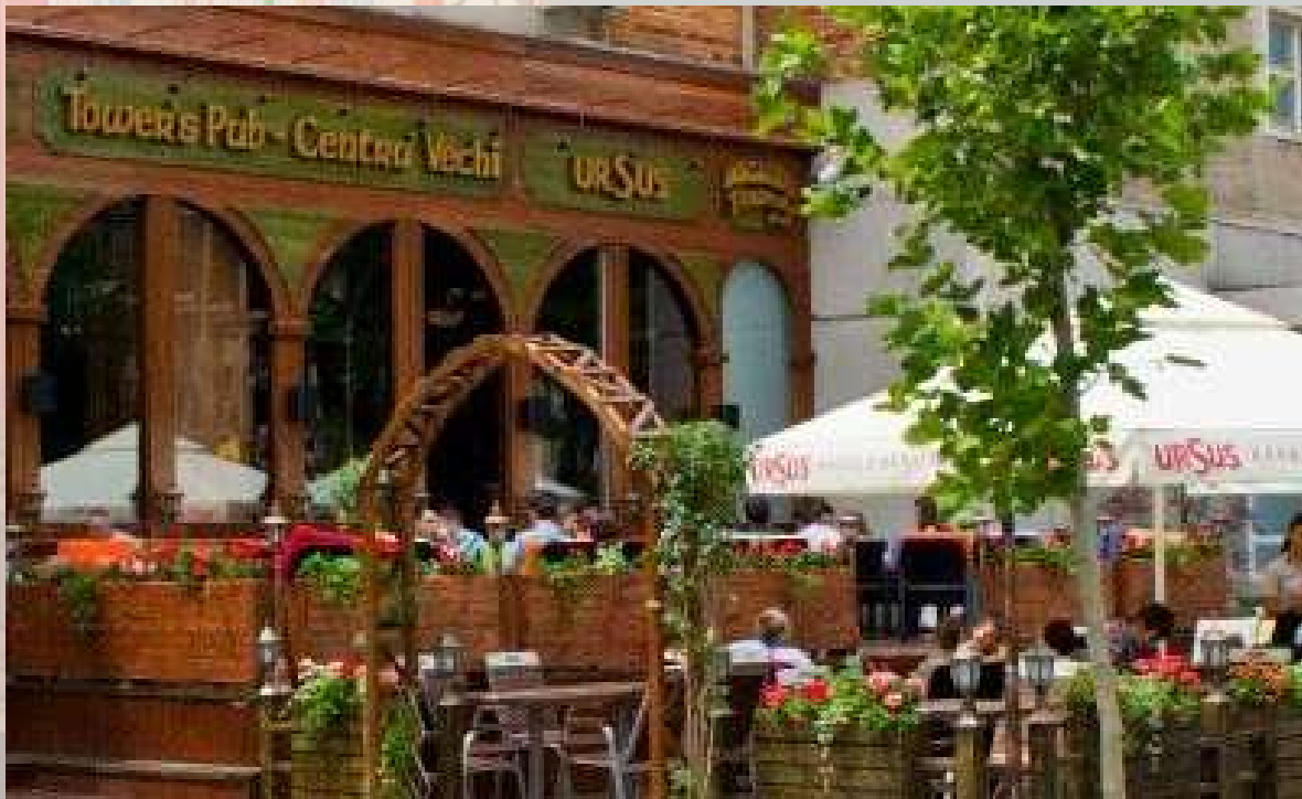
Tower's Pub-Old Center