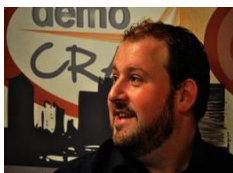
Carmine Rodi Falanga, Italy / Czech Republic : Trainer – Writer – Storyteller - Stand-up comedian . https://www.salto-youth.net/tools/toy/carmine-rodifalanga.786/