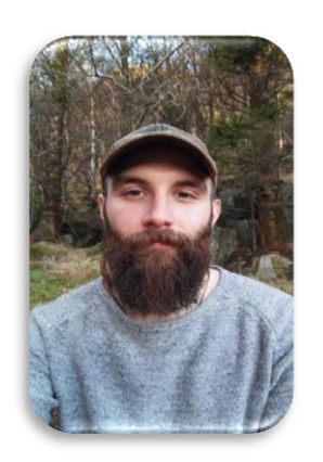
Project Assistant Norway