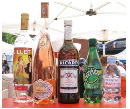
to share with the group.

Each national group should present shortly their country and culture during the intercultural evening. Additionally participants may present drinks and food from their country and region and any other items about their