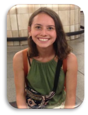
Project Coordinator Germany