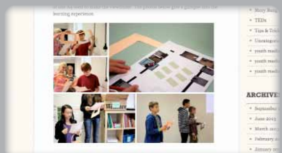
STUDENT LEARNING DOCUMENTED