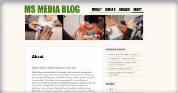
MEDIA IN MIDDLE SCHOOL