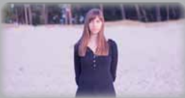
A DANCING DICTIONARY