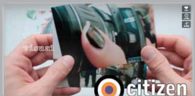
VISUAL GRAMMAR TUTORIAL