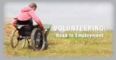
ROAD TO EMPLOYMENT