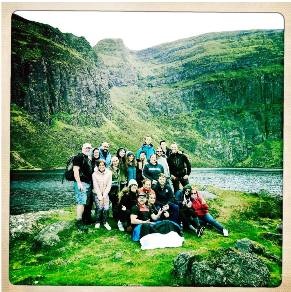
Adventuring in the Comeragh Mountains

Please DO NOT arrive in Waterford City later than 9pm, as there will be no way of transporting you from the city to the venue.