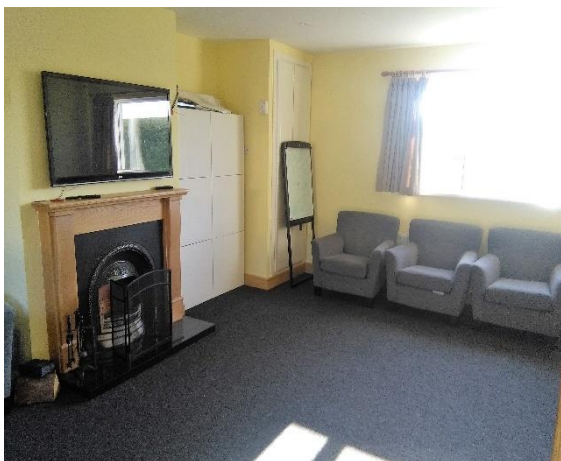
WRAC Training Room

(NB. If you have any allergies, or other dietary requirements, please let us know)