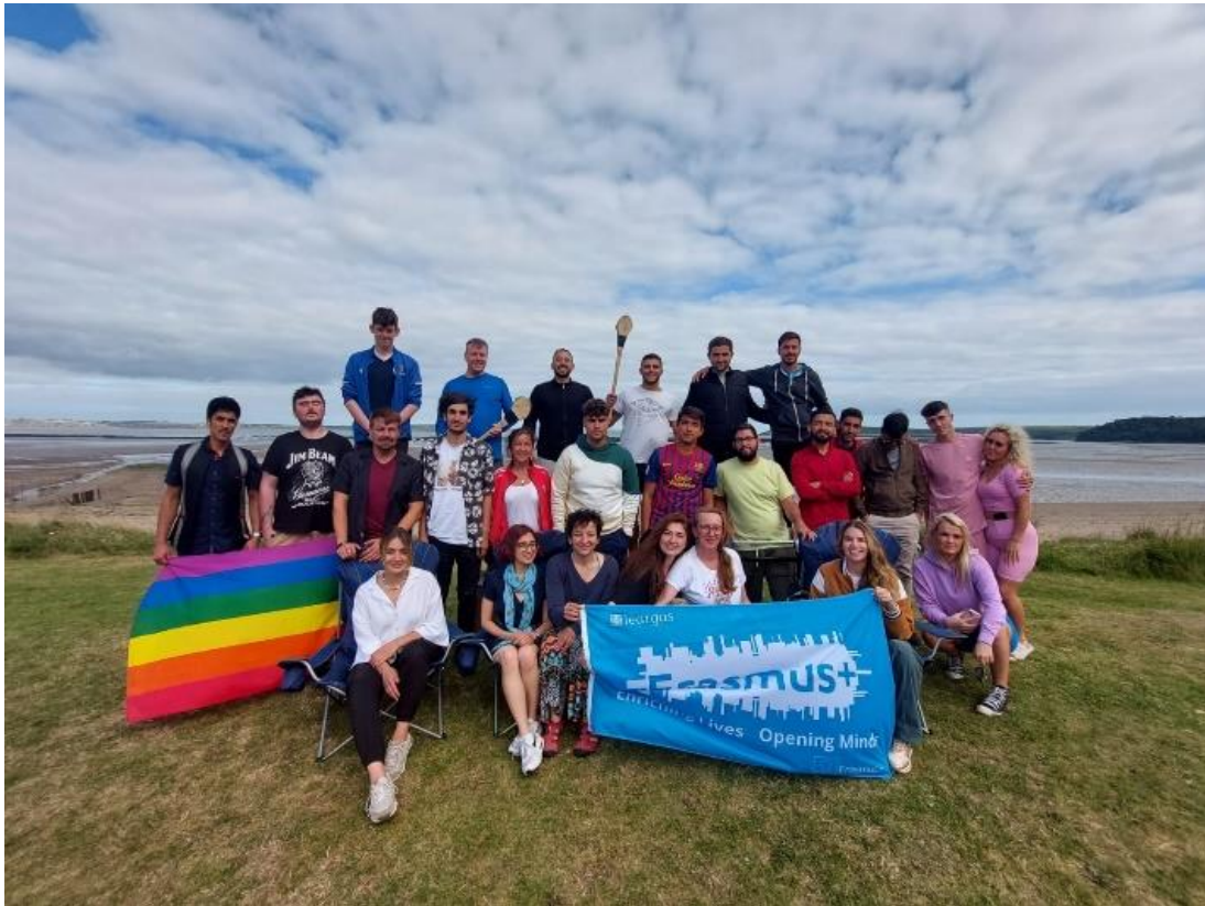
Youth Exchange Group at Woodstown