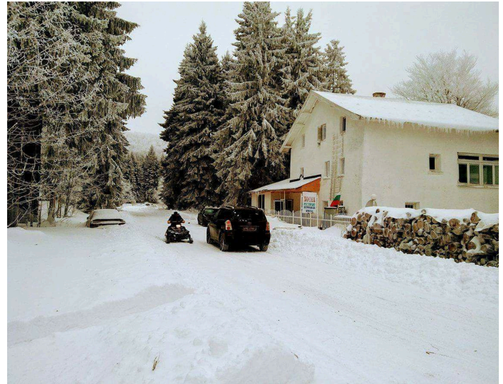
Creative House Petrohan, Bulgaria