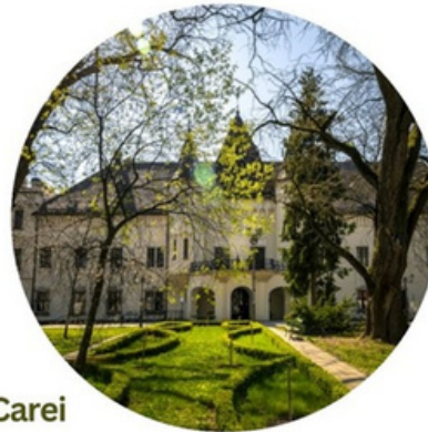
Karolyi Castle, Carei