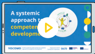
Systemic approach to Competence Development