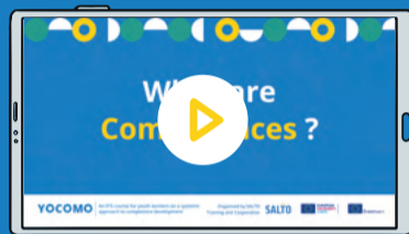
What Do We Mean by Competences