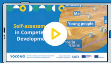
Self-Assessment in Competence Development