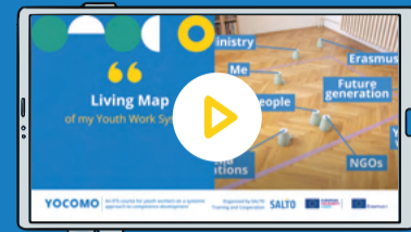
Living Map of My Youth Work System