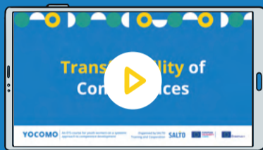
Transferability of Competences