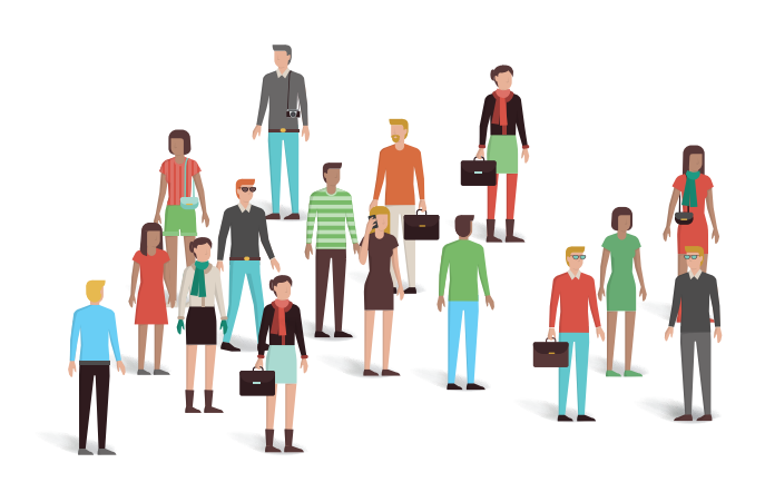
BIBLIOGRAPHY AND ANNEX