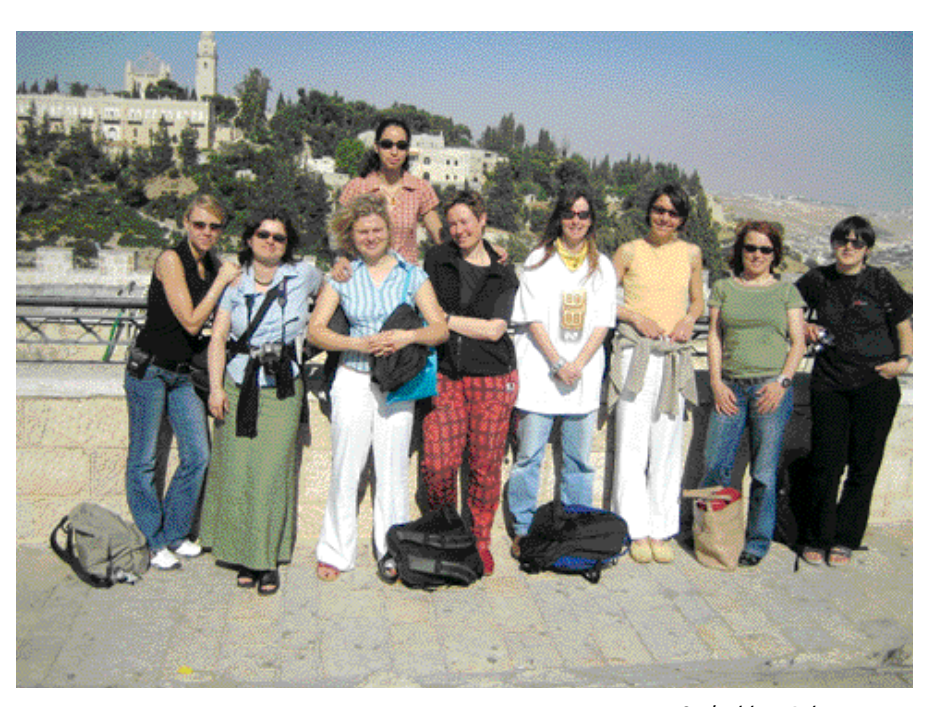
Study visit on Action 2 - 2005.

The decentralisation of the decision process in 2004 enabled us to have a more intensified contact to project holders involved in the EuroMed programme and to give them a more specific support adapted to their needs.