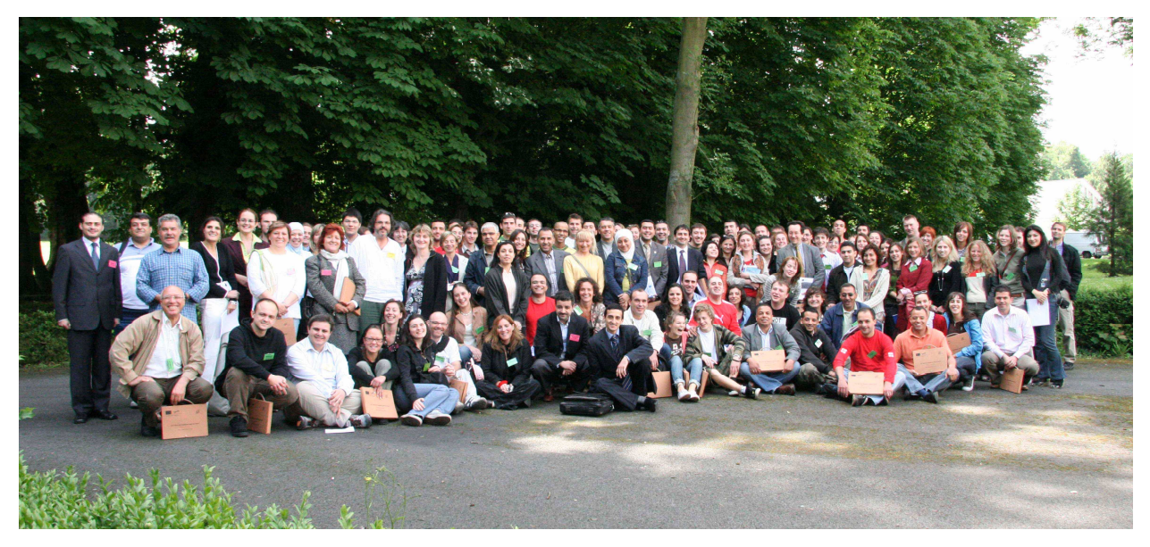
Faces of the neighbourhood

Final Number of participants and profile Total number of participants: 127 From Program Countries: 43 From EECA: 17 From Meda: 13 From SEE: 12 From NAs: 6 From other SALTO RCs: 6 From EuroMed Youth Units: 7 + 1 former NC (Egypt) Team: 7 Expert guests: 8 Others: 7