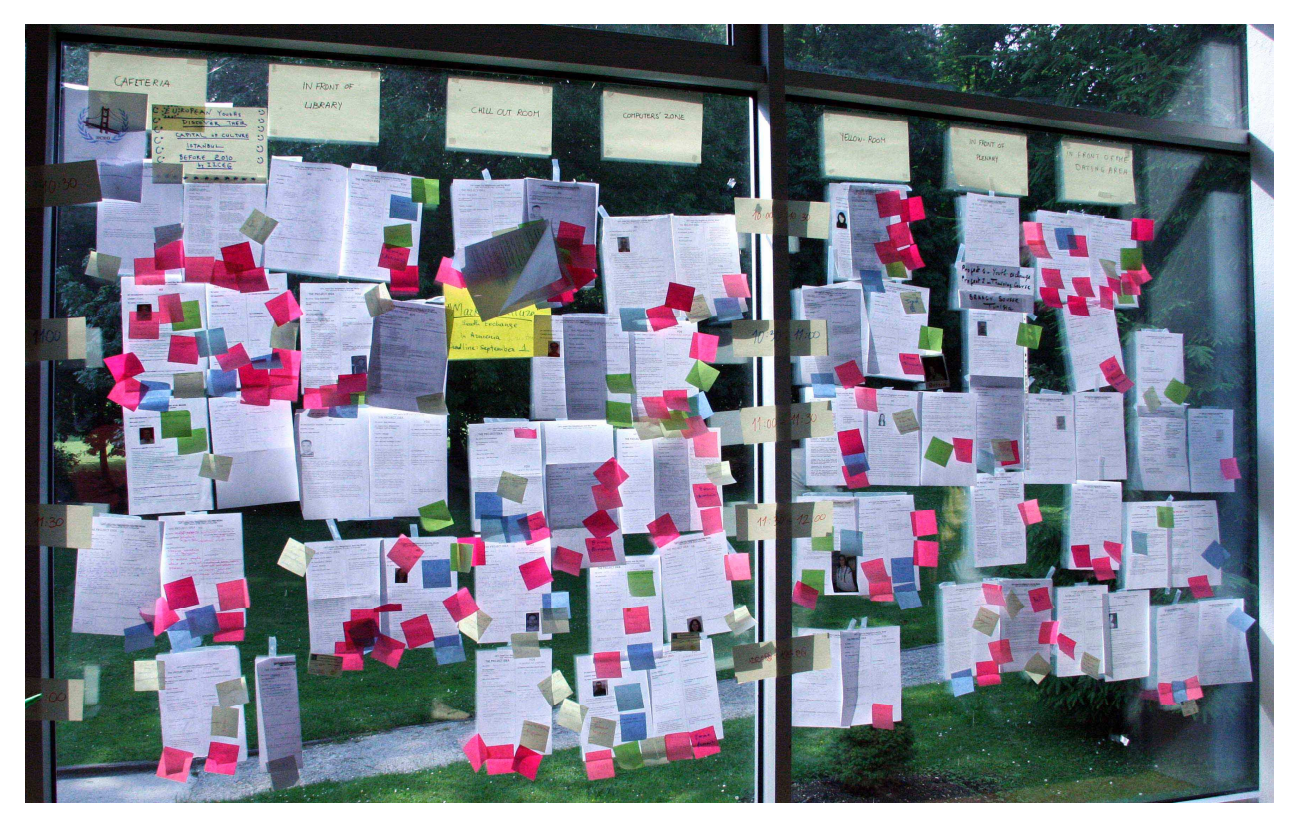
Project ideas are waiting to be discussed on the dating board

Participants has been invited, since the preparation phase before the event, to prepare to be resources of the learning process and they have brought into it their experience, the work on the field of their organisations, their good practices and youth work realities. Participants were empowered to feel the ownership of the space and of the Seminar wherever it was possible. Also we would like to underline that the space of INJEP was used as a structural element of the Seminar.