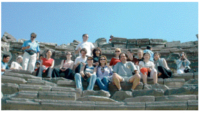
Um Quais - Jordan 2005