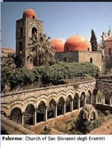
Palermo: Church of San Giovanni degli Eremiti