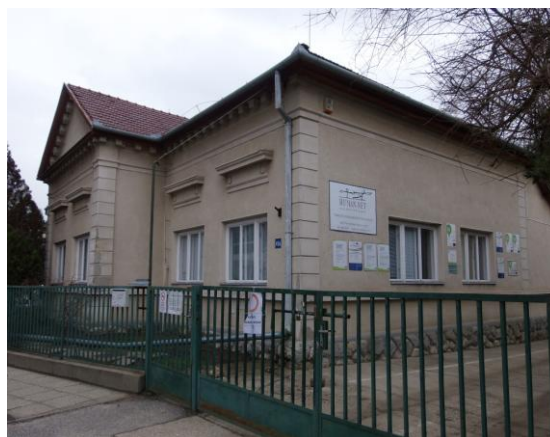
Center of the Foundation