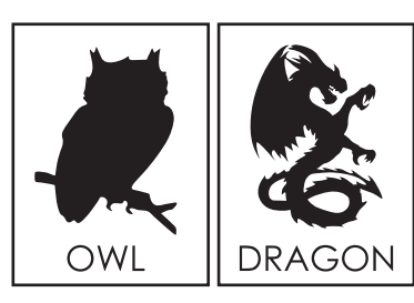
10 sets of strategy cards (fox, owl, ostrich, dragon, dog)