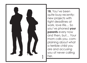
9 pairs of situation cards (for players A and B)