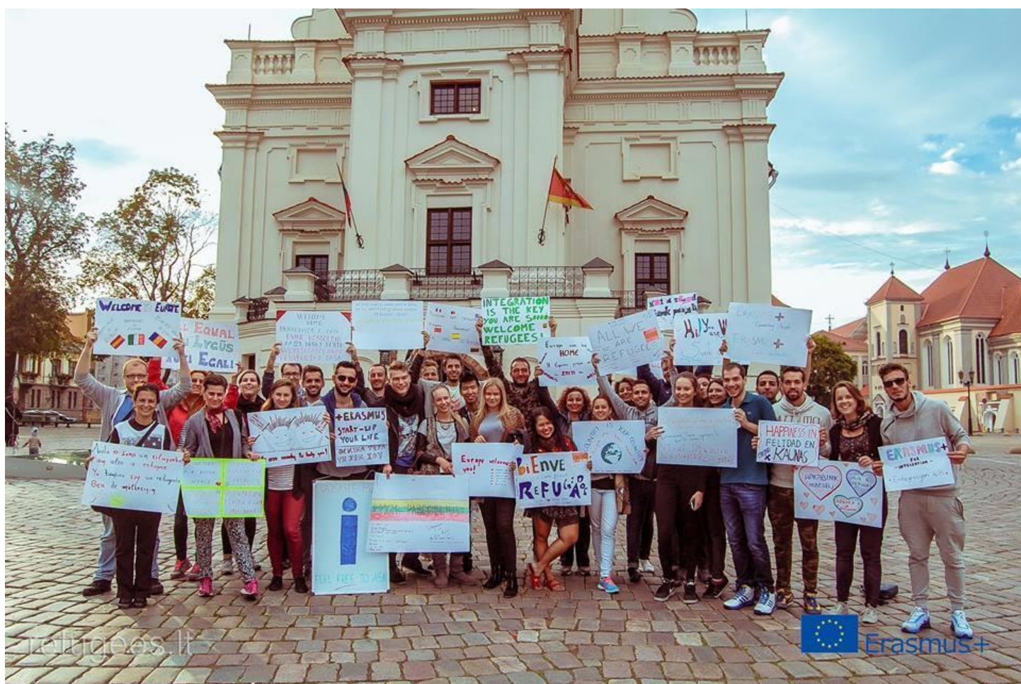
8: Training course's participants supporting help for refugees