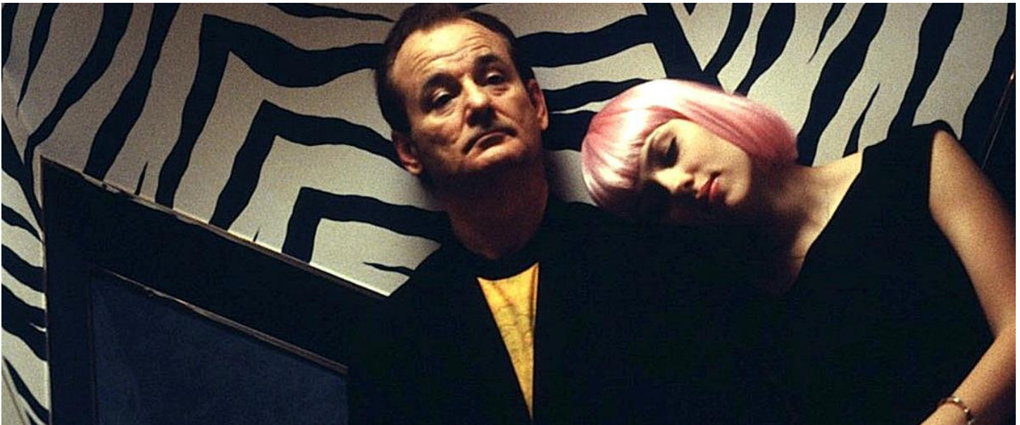
7: Snapshot from a movie "Lost in Translation"

Real-life example: the game is similar to escape rooms around the world. The difference is that it's digital and related with travels.