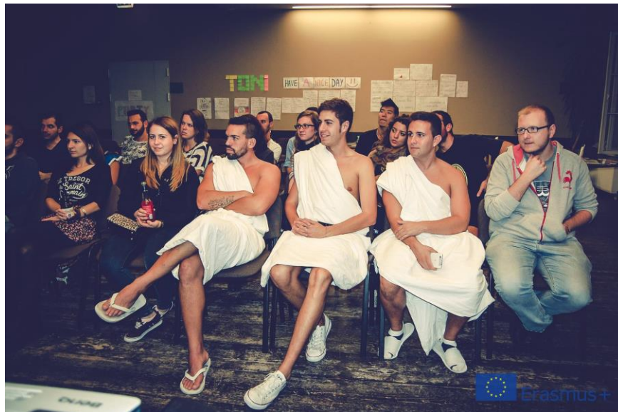
4: thinking about new ideas

The ideas presented below are given in a random order and not according to the points given by the board of decision makers.