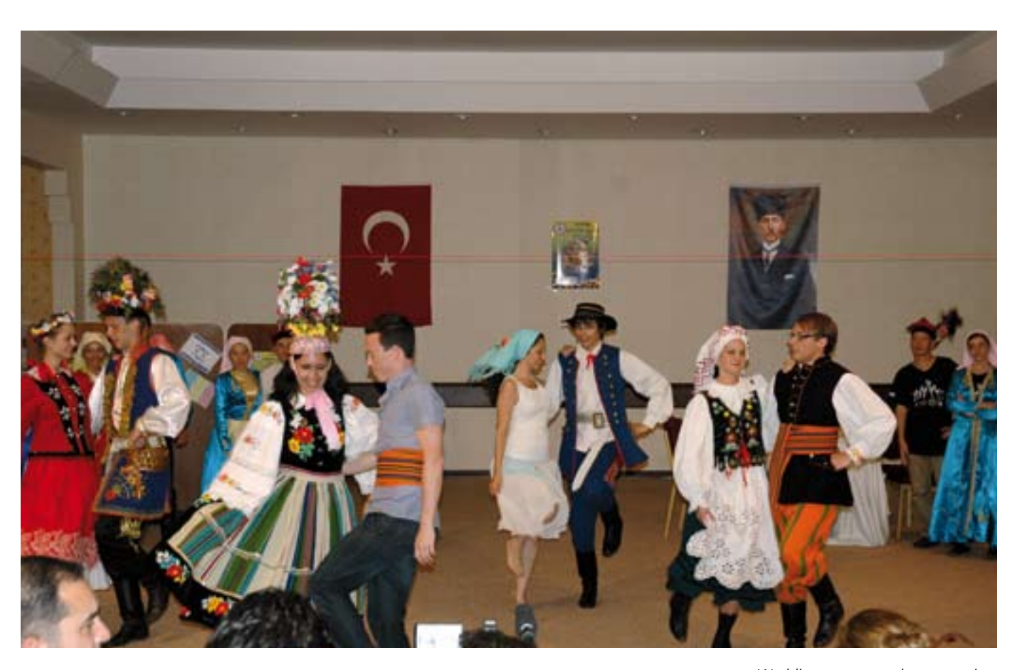
Wedding ceremony demonstrations

similarities in wedding ceremonies from different cultures.