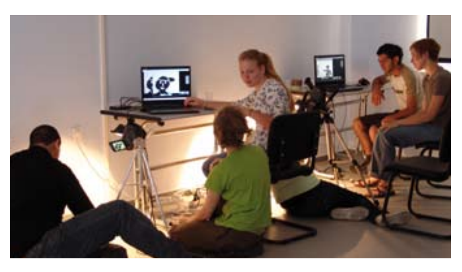
Working on cartoon film

This type of project takes time and a solid information package on a complicated subject requires reflection. In Palestine, many people tend to plan as little as possible since all the ongoing political