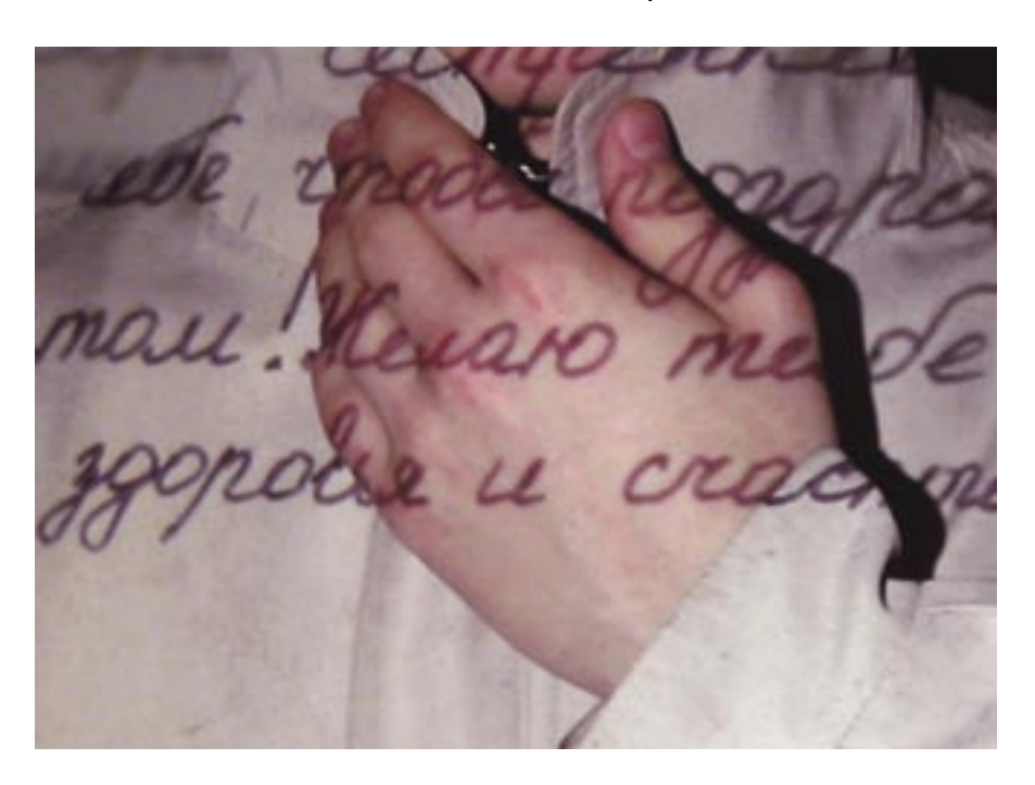
Article 6 UNESCO Universal Declaration on Cultural Diversity

While ensuring the free flow of ideas by word and image, care should be exercised that all cultures can express themselves and make themselves known. Freedom of expression, media pluralism, multilingualism, equal access to arts and to scientific and technological knowledge, including in digital form, and the possibility for all cultures to have access to the means of expression and dissemination are the guarantees of cultural diversity.